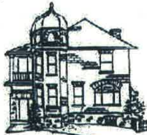
53 George Street