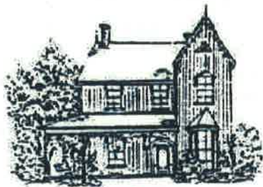
118 Mill Street

"...built on two commanding elevations, along the ravine in which the River Clyde flows...possessing numerous stone buildings, fully as good as those usually found in many provincial towns; having three churches erected upon summits of three of the highest hills; exhibiting all the stir and bustle indicative of a brisk local trade; carrying on extensive milling and manufacturing operations, the situation of Lanark is as romantic as its appearance and surroundings are pleasing."