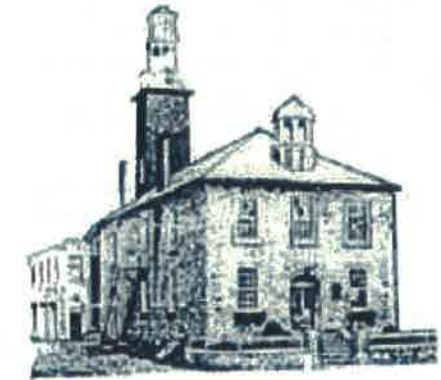
Lanark Highlands Township Hall & Library