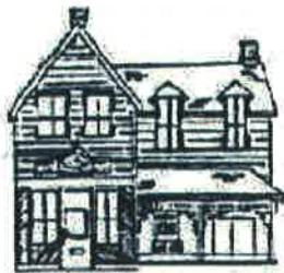
65 George Street