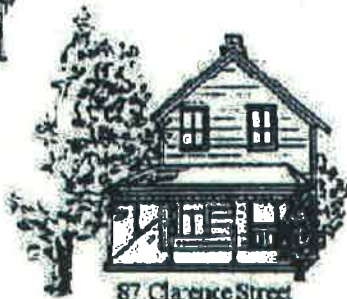
87 Clarence Street